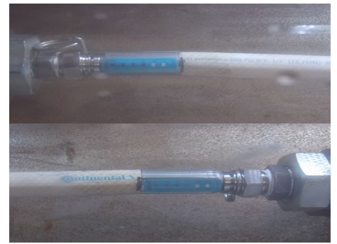
Close-up at 180F temp prior to test