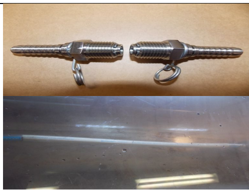
Washdown fittings, top; Assembly in the tester at start, bottom