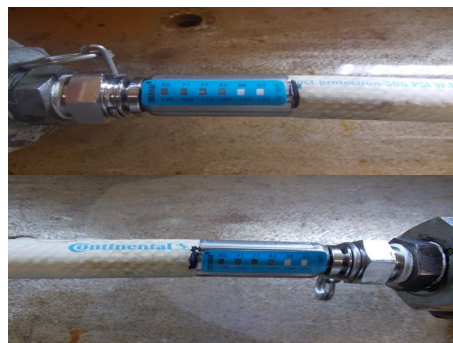
Post failure connections, no movement!