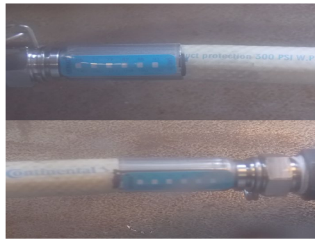
Initial close-up at 58 psi, End 1 (top) End 2 (bottom)