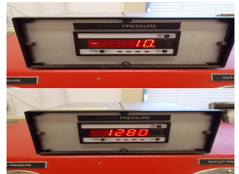
The -10 thermal drift and the registered Peak pressure

PRIMER: We just recently entered into the wash down fitting market with a new offering that employs our proven Bowes/Thor line serration pattern with an interlocking thin walled ferrule as the hose compression member. Made entirely of 316 SS, with a Viton O-ring seal inside the rotating NPT threaded body, we achieved an attractive and highly functional washdown fitting. ContiTech's Super Sani-Wash 300 was selected because it is an excellent hose choice to be used with this new fitting and specifically made for washdown applications.